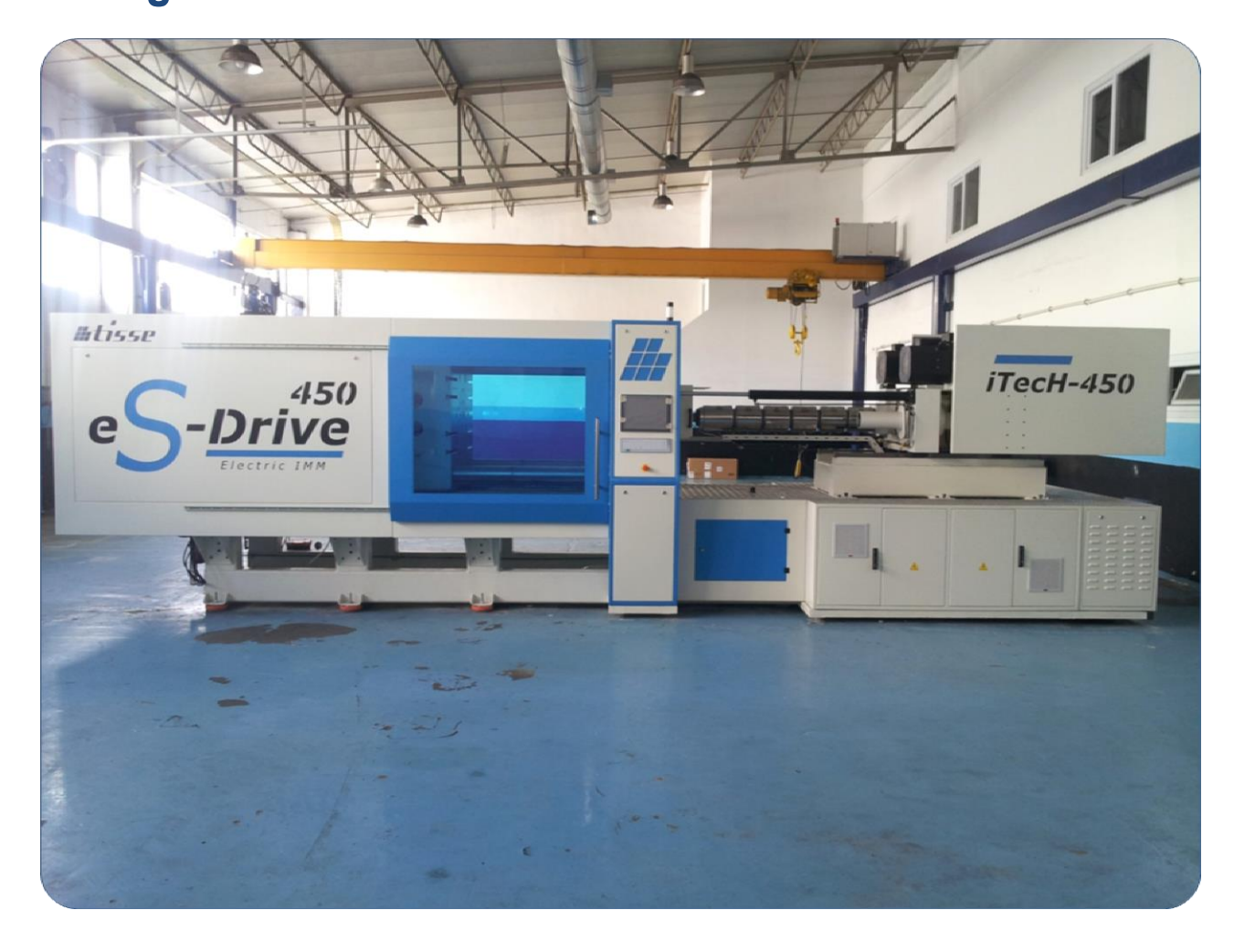
eS-Drive450 Tisse machine, the first Hybrid Machine in plastic injection molding: speed and energy saving

First in Turkey in the field of Plastic Injections, Tisse and Kollmorgen have together developed an electric-hydraulic Hybrid Machine. The Hybrid Machine can manufacture difficult and sensitive products at high speeds; its power and quality eliminate problems like ejection errors and high quantity of wastage. It also increases the production rate and provides energy efficiency up to 35-40% compared to the competition.