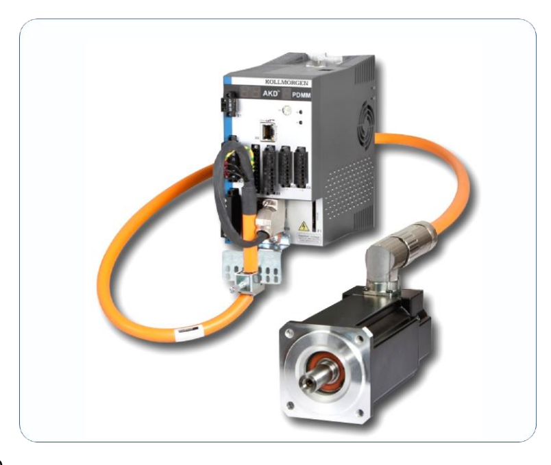
Kollmorgen AKD Servodrive

Thanks to this valve, the grease coming out of the system is re-